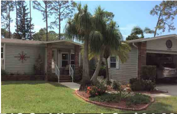
51C Saddlebrook Ct, $64,900