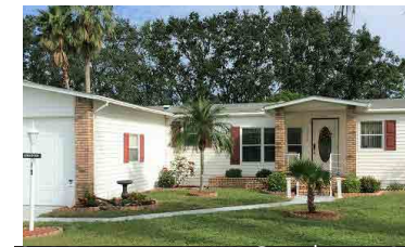
14i Diamond Hill Ct., $57,500