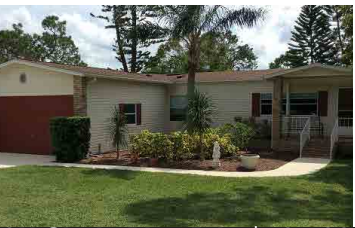
9N Circle Pine Rd., $49,500