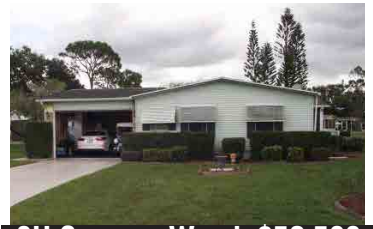
9H Cypress Wood, $52,500