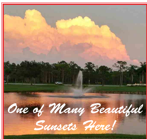
One of Many Beautiful Sunsets Here!