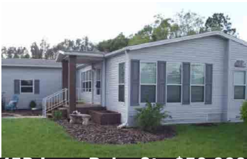
45B Lone Palm Ct., $59,900