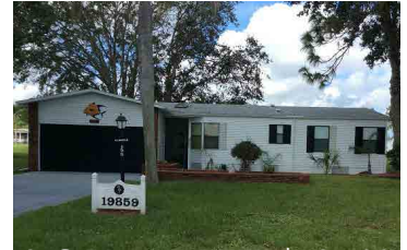
15G Diamond Hill, $46,500