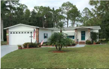
36F Ravines, $79,900