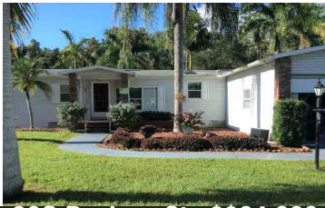
36G Ravines Ct., $64,300