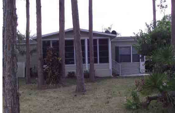
49D Saddlebrook, $38,900