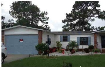
14E Diamond Hill Ct., $53,000