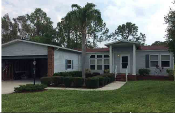
33D Hidden Hills Ct, $69,900

List or purchase your home through the top-selling sales broker for homes on leased land in Pine Lakes Country Club and Lake Fairways. Take a look at these recent listings: