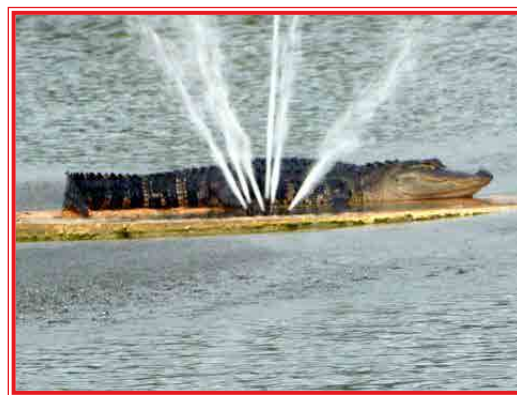
A BIG 'OL GATOR living the dream on the Pine Lakes fountain !!!!