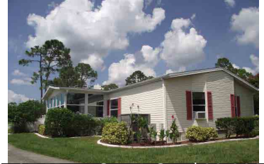
40E Moss Creek Ct., $69,900